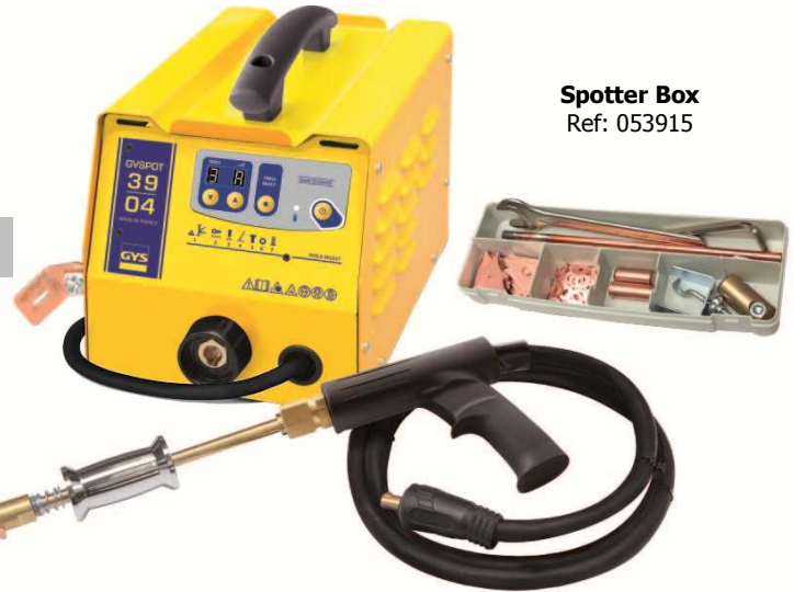
Spotter Box Ref: 053915

Simple to use thanks to its automatic gun and its user friendly control panel.